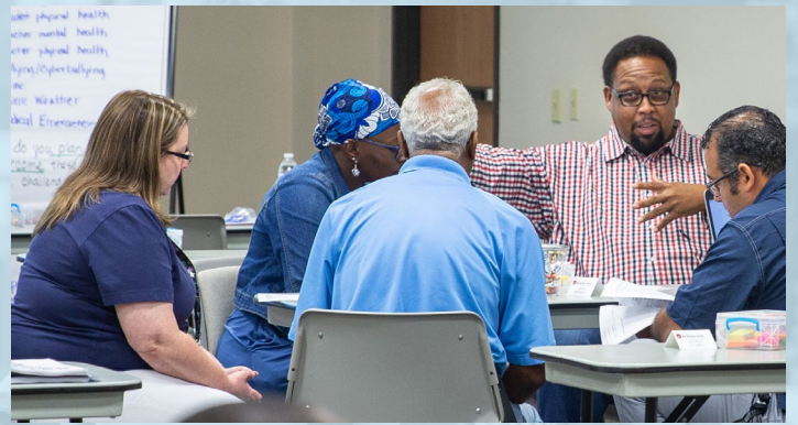
Center For Safe And Secure Schools Hosts Emergency Management Workshop p.4