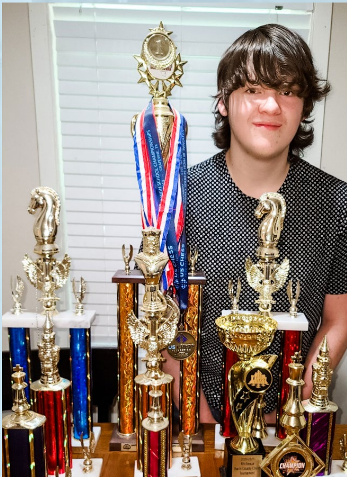
ABS East Student Transforms His Life Through Chess p.2