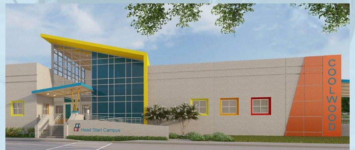
New Coolwood Head Start Making Progress p.5